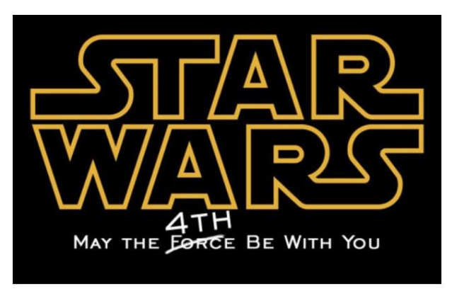
Star Wars is storytelling at its best