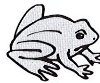
55 tree frogs (green)