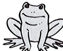
15 grass frogs (green)