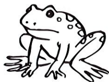
34 grass frogs (spotted)