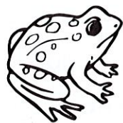
42 tree frogs (spotted)

Sean found these numbers of frogs near the beach.