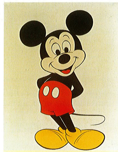
Mickey Mouse, the cartoon creation of Walt Disney.

Walt Disney was an American artist and film producer. His best-known films are the cartoons for which he created characters such as Mickey Mouse, Donald Duck and Pluto. Disney was born in the city of Chicago. In 1923 he made the world's first successful cartoon film, Oswald the Rabbit , but it was Mickey Mouse, who first appeared in 1928, that made cartoons really popular. The first Mickey Mouse movie was made in black and white; Disney's first colour cartoon was Snow White and the Seven Dwarfs (1937). Several successful films followed, many of which are still regularly shown, including Bambi , Dumbo and Pinocchio . In the 1940s Disney began making colour nature films (which won several Academy Awards, or 'Oscars') and feature films for children such as Treasure Island , and Mary Poppins , in which cartoons and live actors are combined.