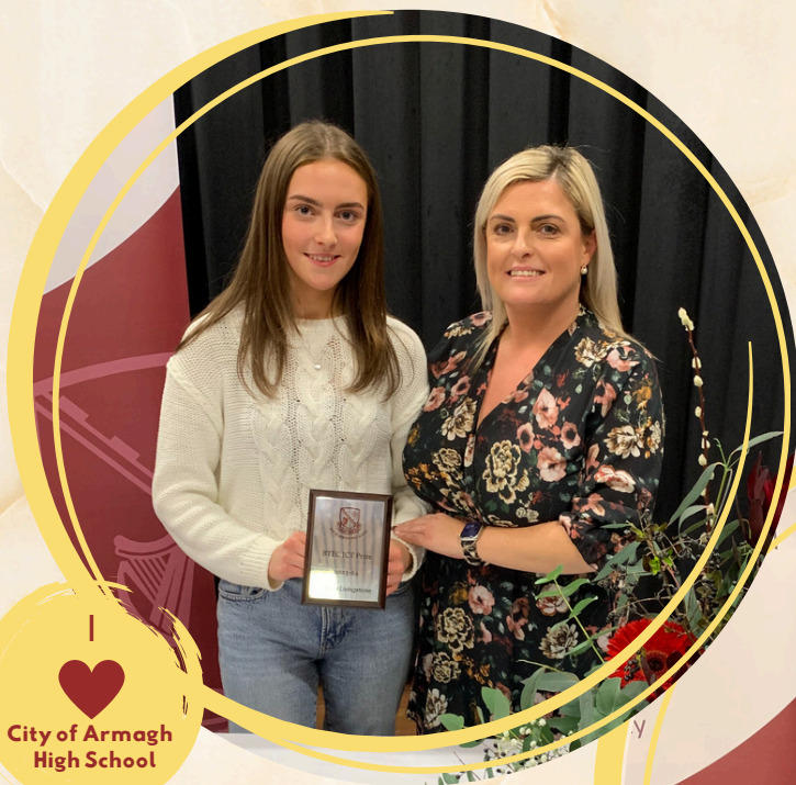
I City of Armagh High School