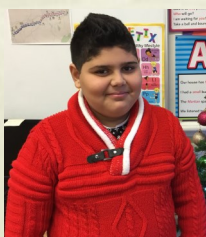
Some P7MM Christmas Jump-

Despite not being able to go to a live pantomime this year, classes thoroughly enjoyed a performance of 'Beauty & the Beast', staged and live streamed by the students of SRC Armagh. It was very professionally delivered, using up-to-date music and references that the children 'got'. Many thanks to all the members of the cast and crew from SRC Armagh.