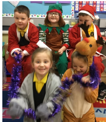
Festive fun on board the P3MT sleigh!!