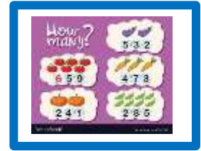
Touch Counting 0-10