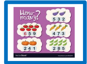
Touch Counting 0-10