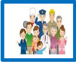
People Who Help Us