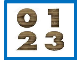
Working with 0-3