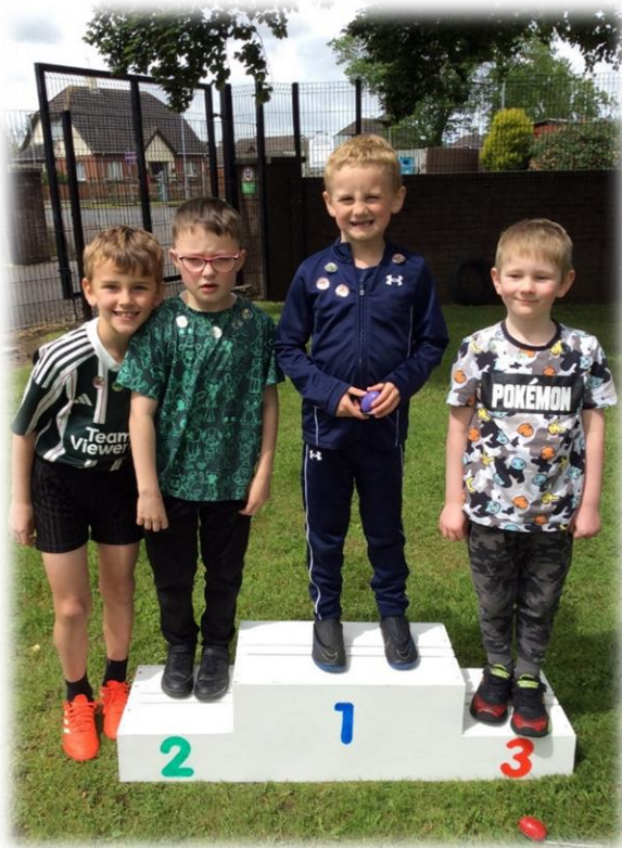
The KS1 boys took part really well and loved getting their medals.