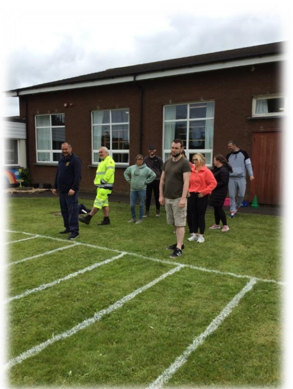
Thank you to all the parents who took part.