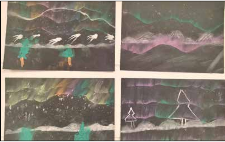
Northern Lights Ms Ahern 2nd class