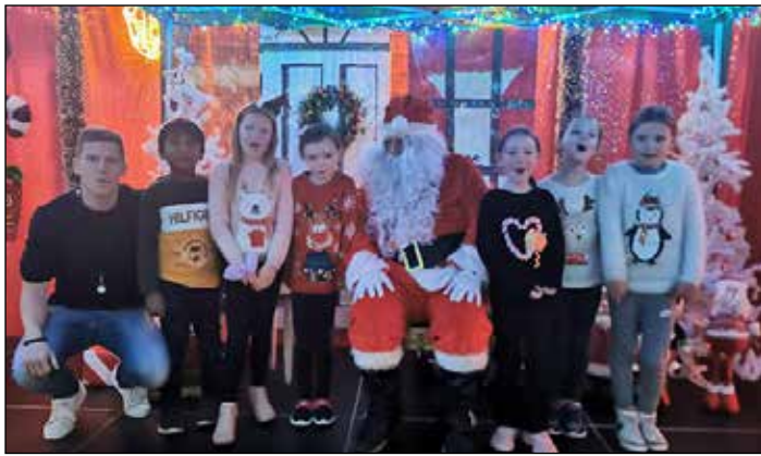
Naughty or nice