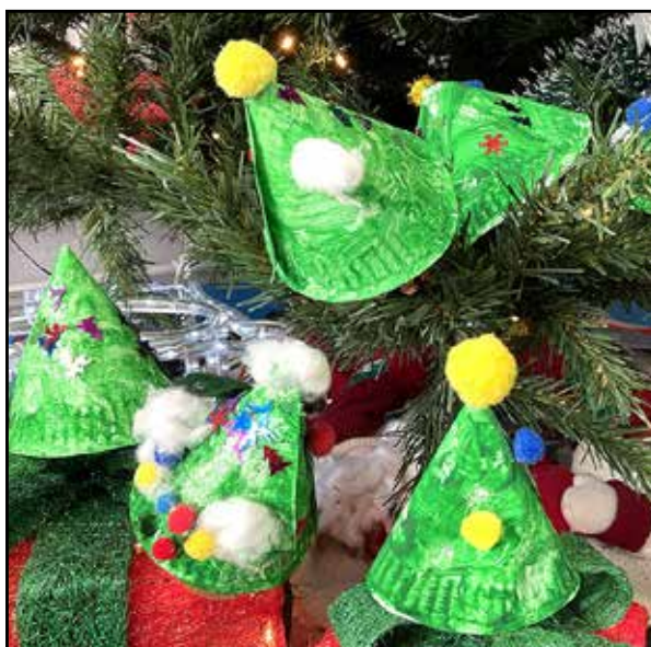
Christmas Trees Room 23 Cabhair Centre