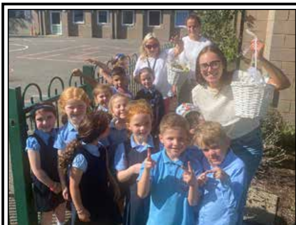
Fun gathering St Helen's Apple Harvest!