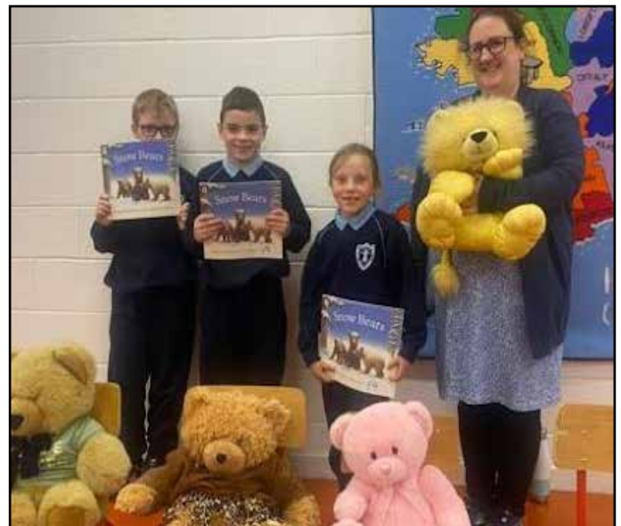
Storytelling - Snow Bears at Winter Assembly