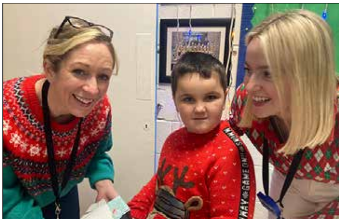
Happy with Santa's visit