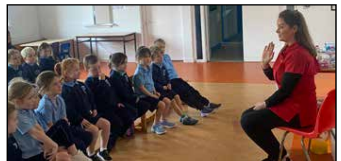
Victoria from Bonnybrook Pharmacy talks to our pupils about nasal flu vaccine, 17 October 2023