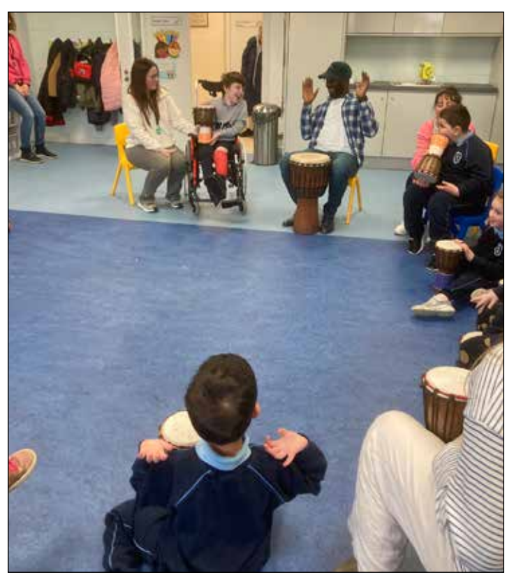
Music Workshop in Cabhair Centre