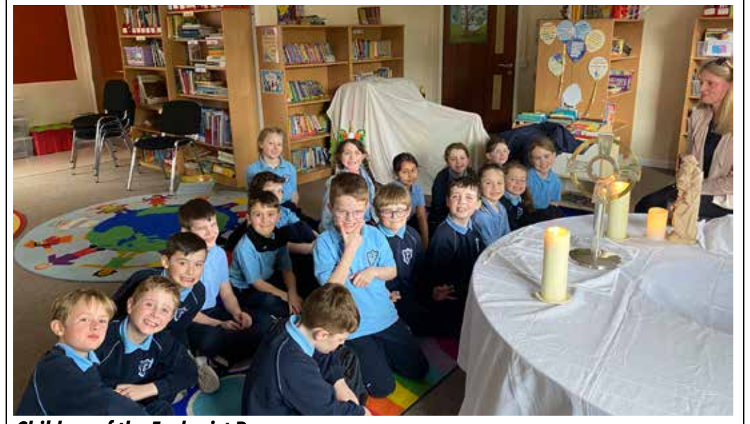
Children of the Eucharist Room