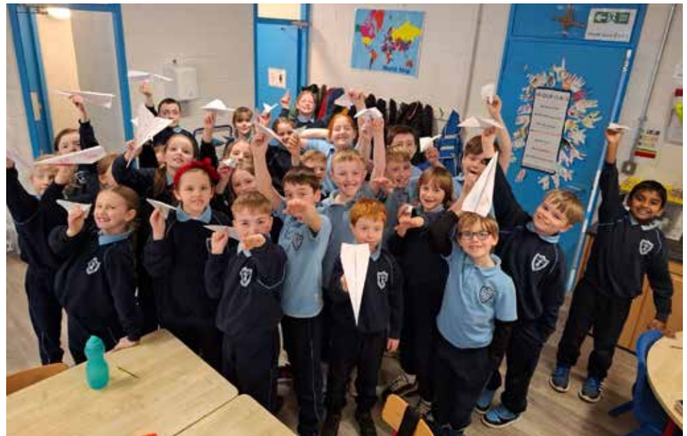
Second Class Room 6