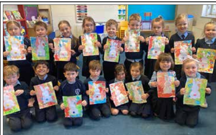
The boys and girls in Ms Fleming's Junior Infants painted beautiful bunnies for our Easter art. Well done everyone.