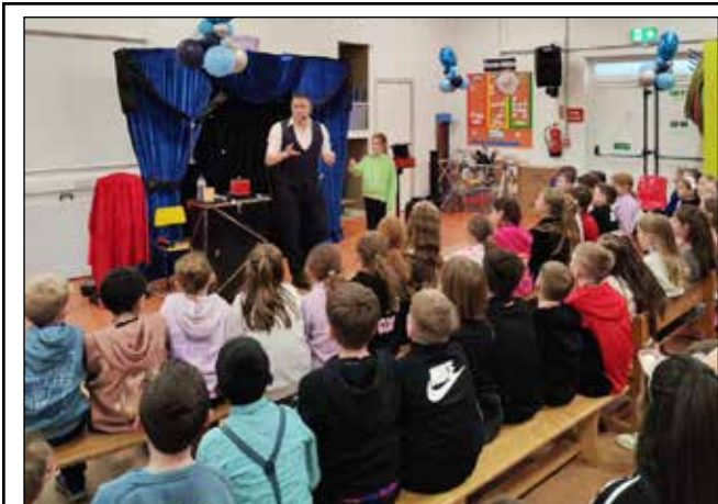
Magician at our Communion party in school!