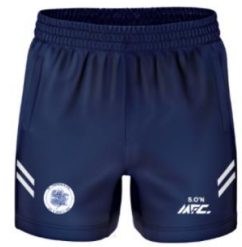
LEISURE SHORTS £ 17.00 / £ 21.00