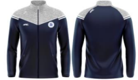
FULL ZIP (FLEECE POLYESTER) £ 28.00 / £ 34.00