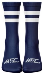
HALF SOCKS £ 7.50 / £ 10.00