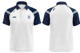
POLO SHIRT £ 21.00 / £ 27.00