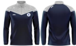
HALF ZIP (FLEECE POLYESTER) £ 28.00 / £ 34.00