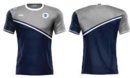
TRAINING JERSEY (NEAT FIT) £ 21.00 / £ 26.00