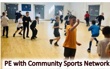
PE with Community Sports Network