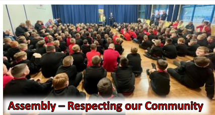
Assembly – Respecting our Community