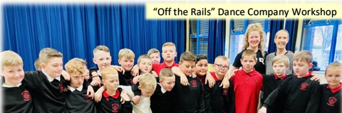
"Off the Rails" Dance Company Workshop