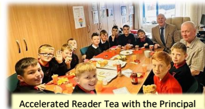
Accelerated Reader Tea with the Principal