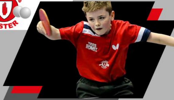
Table Tennis Ulster

Table Tennis Ulster is responsible for the everyday organisation of the sport in the province of Ulster, and is committed to facilitating everyone from beginners to elite players, as well as our over 50's Bat and Chat players, to help develop their potential and enjoy the sport of Table Tennis.