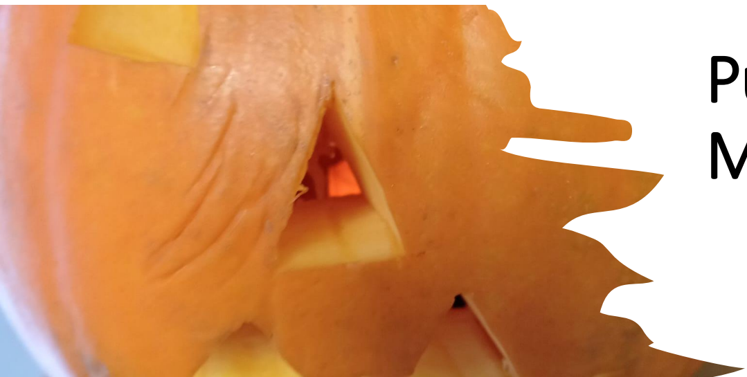
Pumpkin Carving in Ms. O'Dwyer's Class