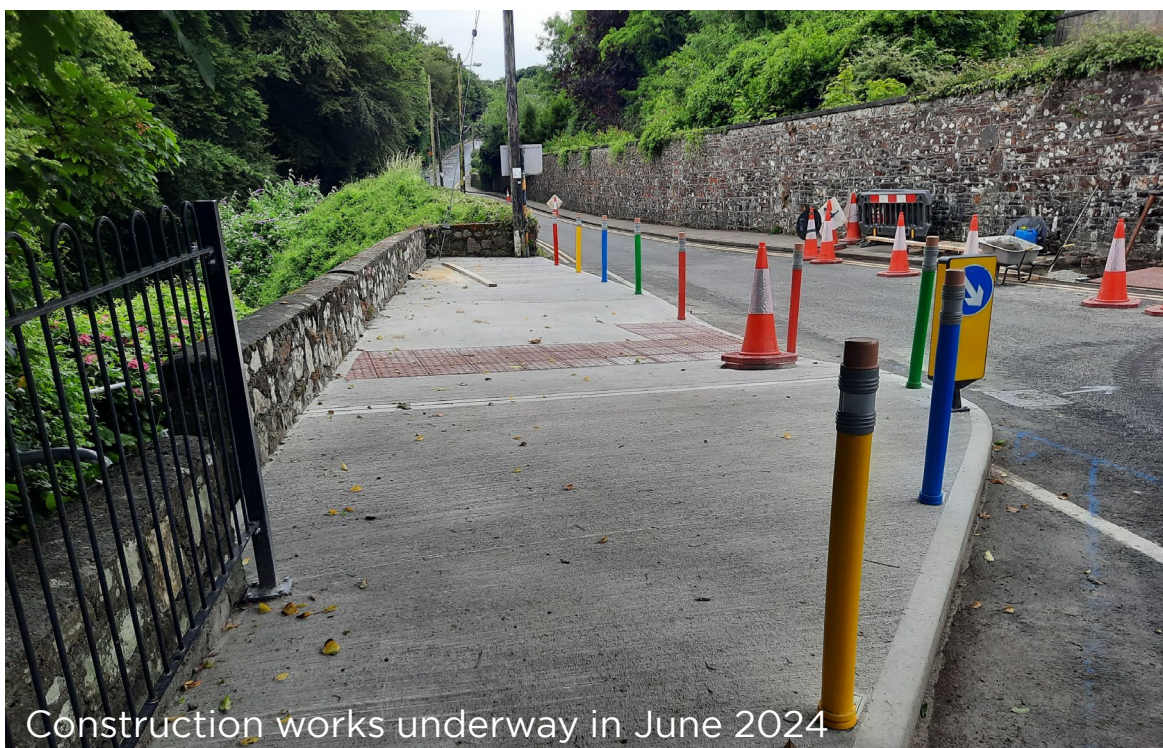
Construction works underway in June 2024

The School Zone includes colourful signage, pencil bollards, planters, and road markings to clearly mark the front of school area. Raised crossings and a bus bay have also been introduced. Improvements to routes along Hayes's Hill, Upper Road, and Middle Road, as well as improvements to pedestrian access entering the school will make the route to school safer and more pleasant.