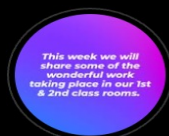
1st & 2nd Cl...

Large, co-ed junior school located in Swords, Co Dublin.