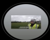
Safe routes ...