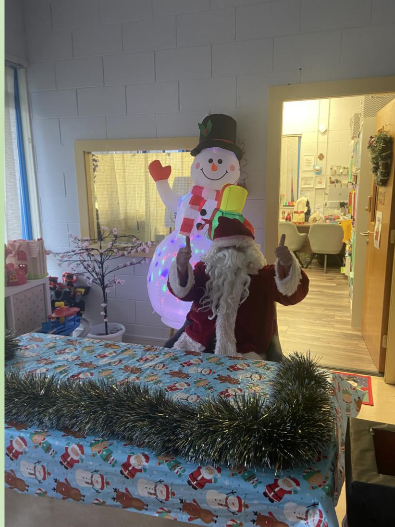
Santa waiting to meet our amazing children!