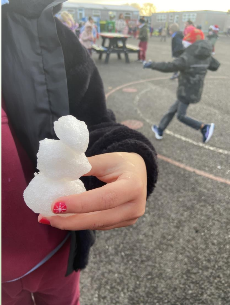
One of our talented children got creative on an icy day and built her own snowman!