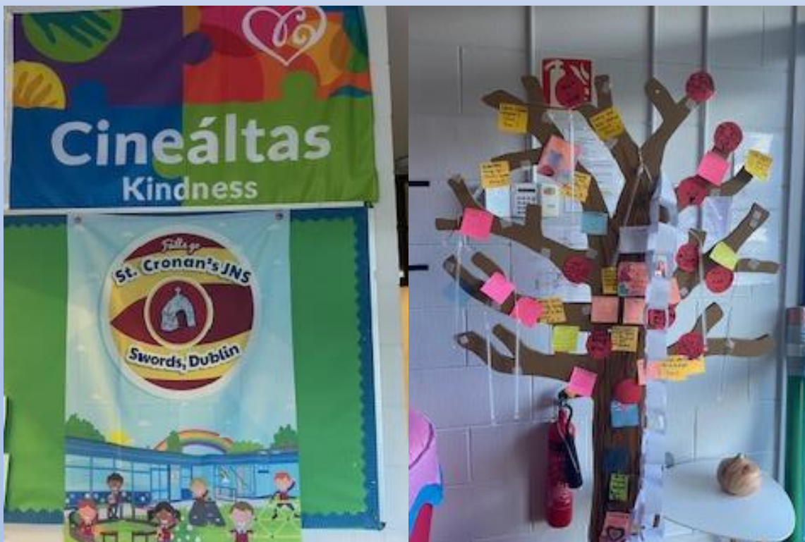
Kindness Week photos - our Cineáltas Flag and our Kindness Tree