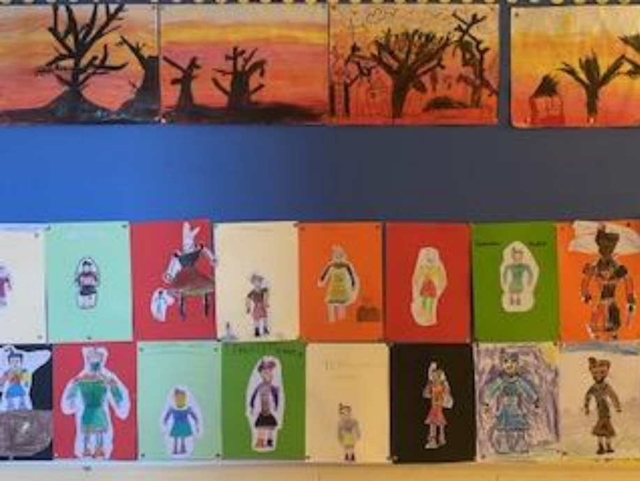
Beautiful February Art Work on our colourful corridors