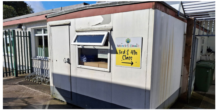
Prefabs that are to be replaced