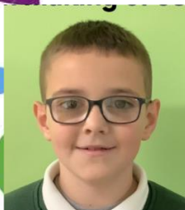
P7 "I enjoy doing the different jobs throughout the school."