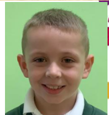
P3 "I have respect for our school and want to continue to look after it."