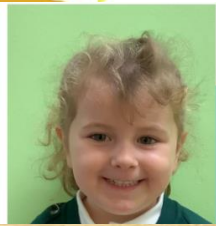
P1 "I like talking to the older boys and girls at our meetings."