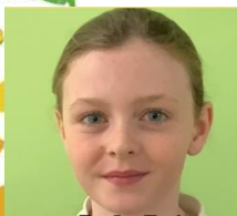
P6 "I enjoy being responsible for decision making in our school."