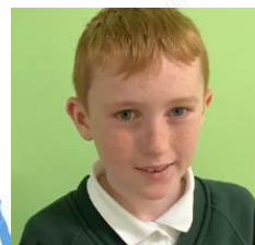
P6 "I like getting a say in school trips and fun days."