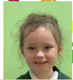
P2 "I enjoy talking about what needs fixed in our school."