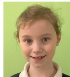
P5 "I love taking people's ideas and using them to improve our school."