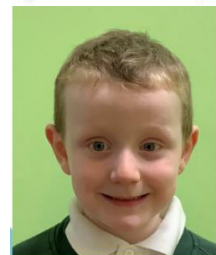
P2 "I like helping come up with more clubs in our school."