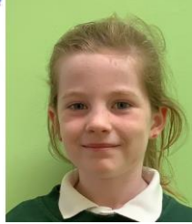
P4 "I like getting to fix things in our school."