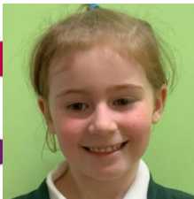
P3 "I enjoy coming up with good ideas and sensible choices for our school."