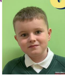
P4 "I enjoy coming up with good ideas to improve our school."