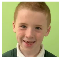
P5 "I love coming up with ideas to raise money for our school."