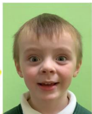
P1 "I like helping our school."