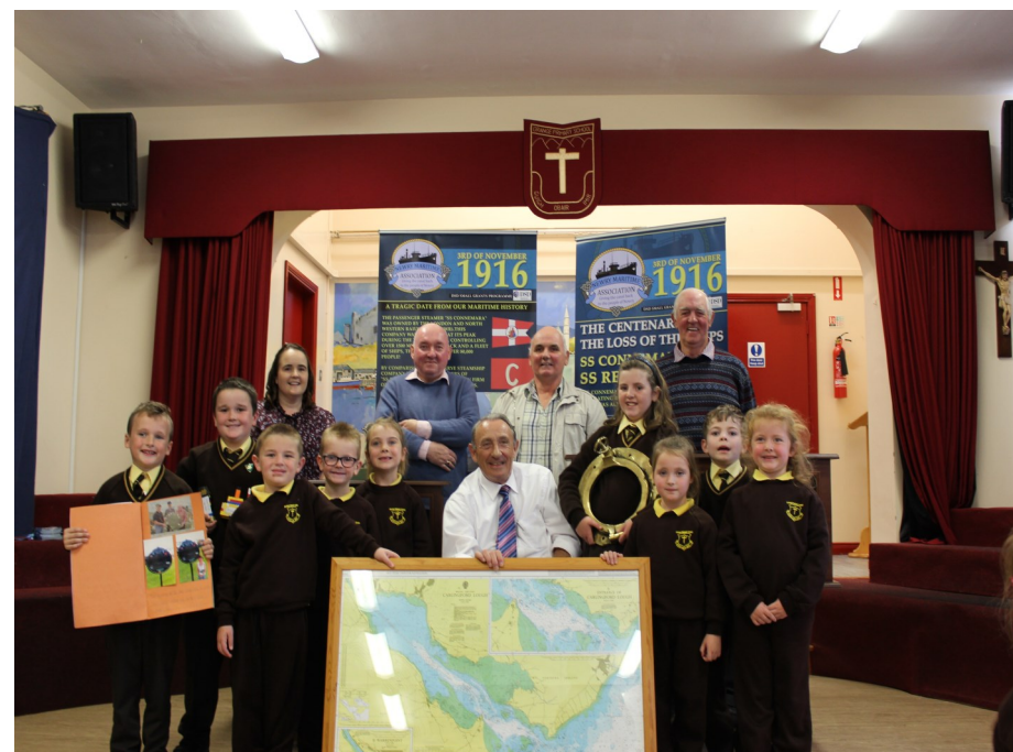
Newry Maritime Association are pictured after their presentation on Monday.

School tel: 4176 2033 email: info@grange.kilkeel.ni.sch.uk