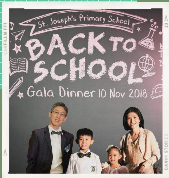
FATHER OF ISAAC MOK (6C)