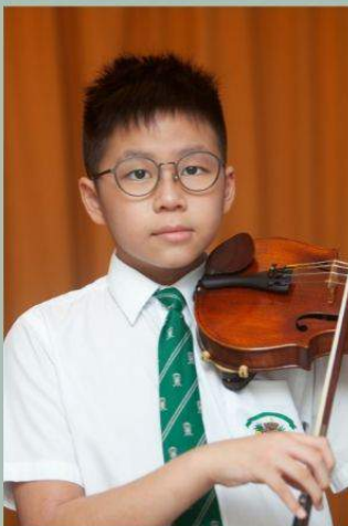
Zi Minu 5E

Life before 2020 was very carefree. We could go to school, play in the parks and do sports with no difficulty. Everything went on very well until the pandemic came.