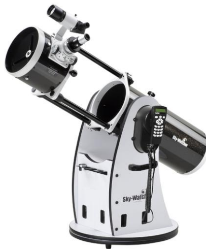
Figure 4 Dob Collapsible OTA installed on Dob SynScan Upgrade Kit