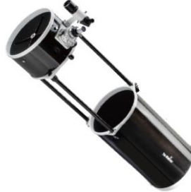
Figure 1 Dob Collapsible OTA

WARNING: The following procedures should be done by professional authorized dealers only. Users who like to Do-It-Yourself should bear their own risk. Sky-Watcher Telescope is not responsible for the damages resulting from installation attempts.