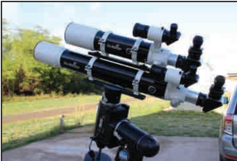
Image 4 - A close up of the ProED 100 and ProEd 80 telescopes.

cool thing about these binaries is an imaginary line passing through the Epsilon 1 pair is perpendicular to an imaginary line passing through the Epsilon 2 pair. My seeing was the typical Kauai sea level one arc second, so the ProED 100 had no difficulty splitting both close pairs. However, using the 5-mm eyepiece, I saw more dark space between the close pairs than I have ever seen before in any telescope! This is definitely a great instrument for binary star observers.