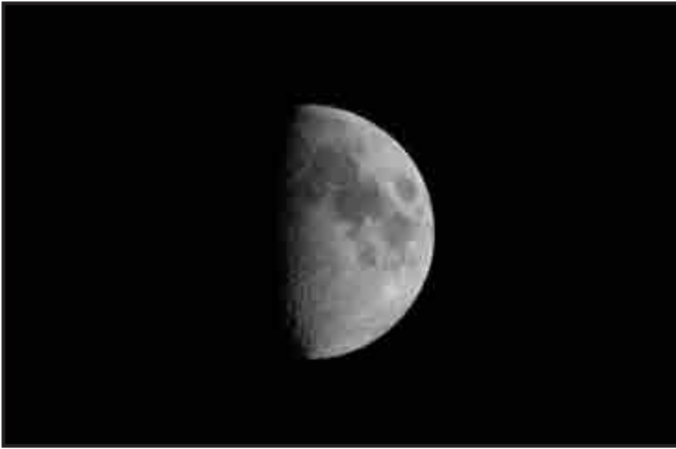
Image 5 - The author took this image of the first-quarter moon with the ProED 100 and a Canon 600D DSLR camera, 1/250s exposure.

cent as much light as the ProED 100 and 44 percent as much light as the ProED 120. However, the telescope's smaller size may appeal to someone looking for a light grab-and-go telescope, or a travel scope. The fully loaded case weighs well under 20 pounds and easily fits in most airline overhead compartments.