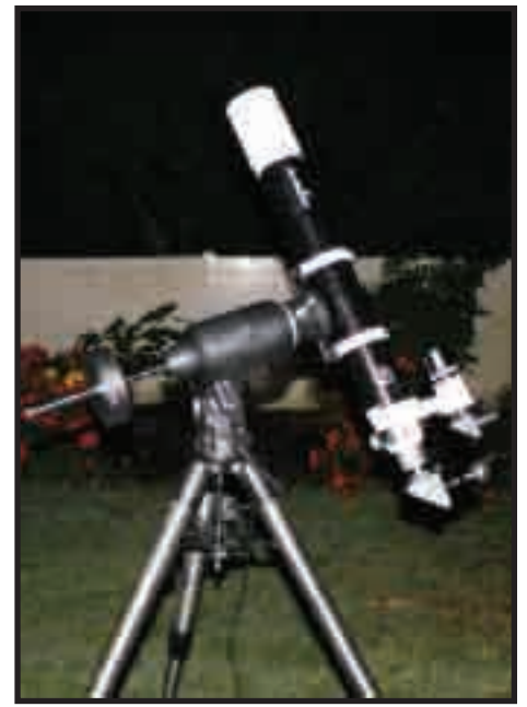
Image 6 - The ProED 100 set up for observing in the author's backyard.

The Sky-Watcher USA ProED Doublet refractors have superb optics and offer thrilling visual experiences. The three models range from a small, easy-to-transport 80-mm to the impressive 120-mm large refractor. Sky-Watcher USA's efforts to package each with a hard case filled with myriad accessories makes these telescopes definite winners for hobbyists looking for a complete refracting telescope system. AT