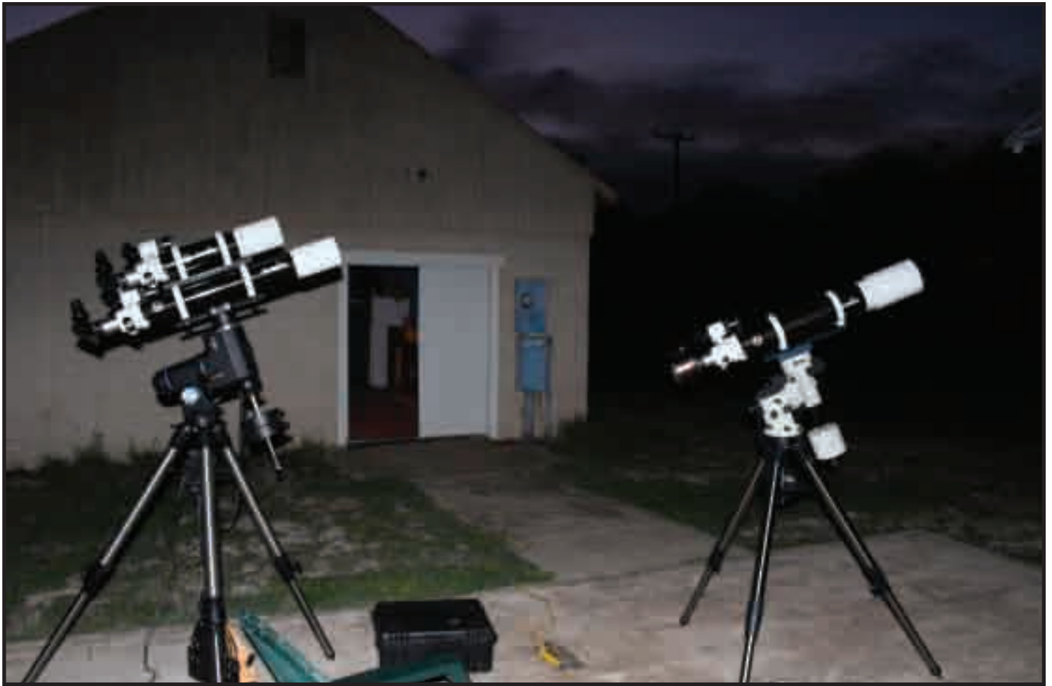
Image 3 - The complete ProED series of telescopes set up at the KEASA roll-off roof observatory ( http://www.keasa.org/ ).