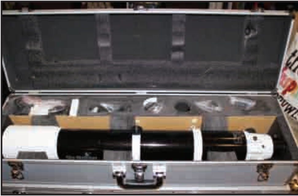
Image 2 - The ProED 100, case and accessories.

most commercial German equatorial mounts. While the larger scope comes with a Losmandy-style dovetail plate, the two smaller models come with