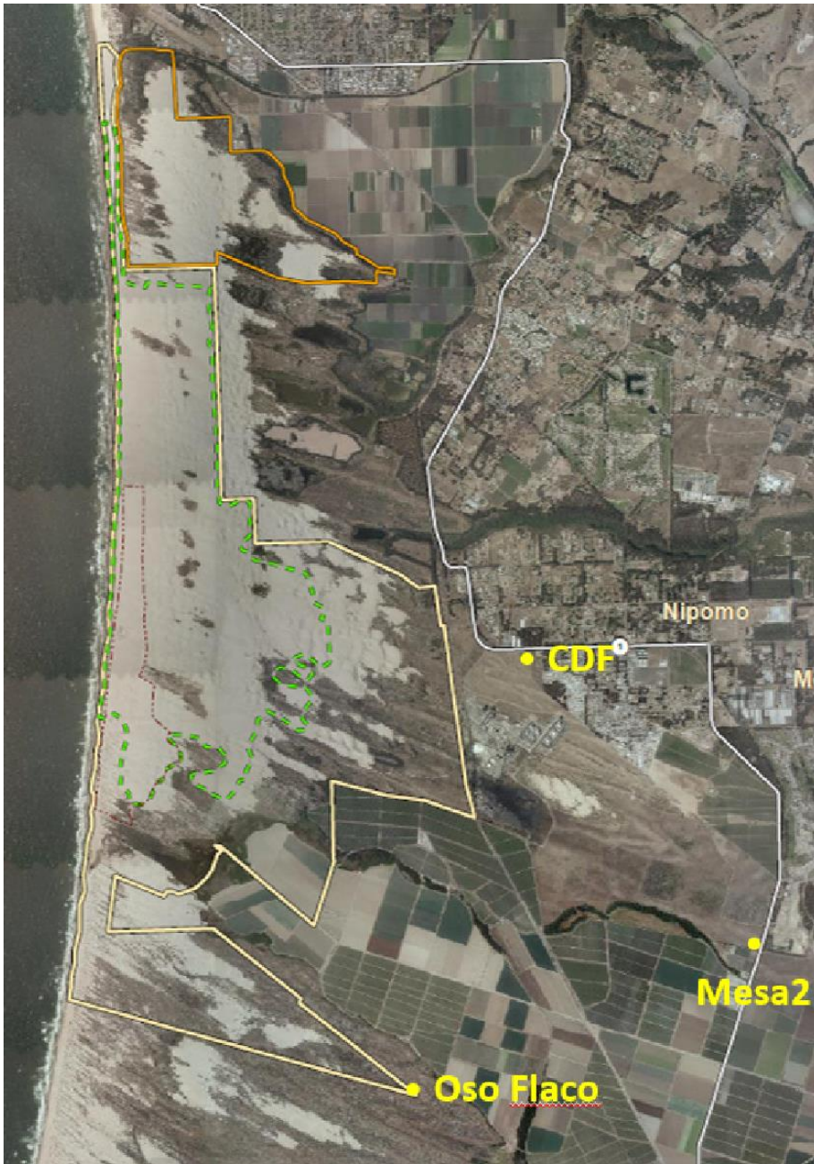
Figure C1. The locations of the APCD monitoring sites CDF, Oso Flaco, and Mesa2.