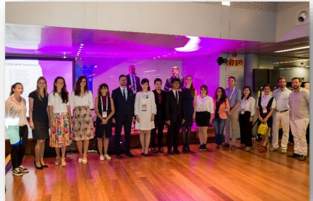
2019 CED-IADR Travel Award Winners. List of Winners can be viewed here .