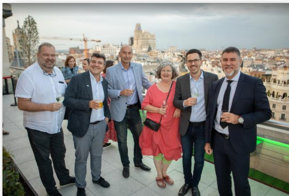
Chilling & networking with colleagues at the Congress Get-together.