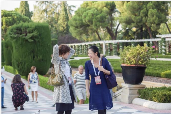
Parque del Retiro, Jardines de Cecilio Rodríguez

A congress is a place to network with peers and to establish new research opportunities, and to make new professional relationships or strengthen existing ones. The organizing committee selected beautiful locations for this year's social events. The Opening Ceremony took place in the fabulous garden named Parque del Retiro, Jardines de Cecilio Rodríguez , and allowed attendees to enjoy the beauty of Madrid in September and the hospitality of the city of Madrid, represented by the Madrid Convention Bureau (MCB).