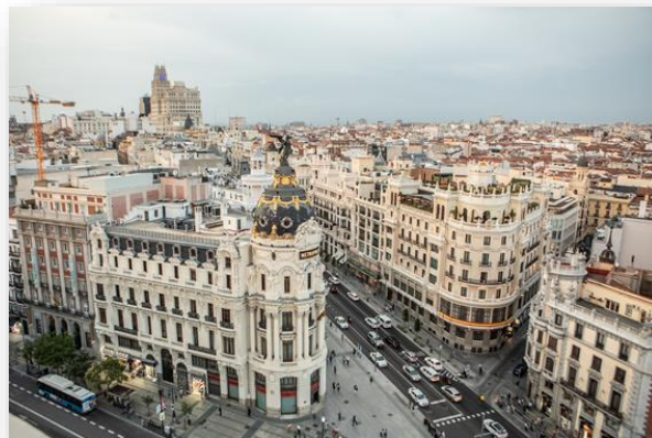
Rooftop terrace of the cultural centre 'Círculo de Bellas Artes': panoramic view on the old city of Madrid.

Our sincere thanks go to the congress sponsors :