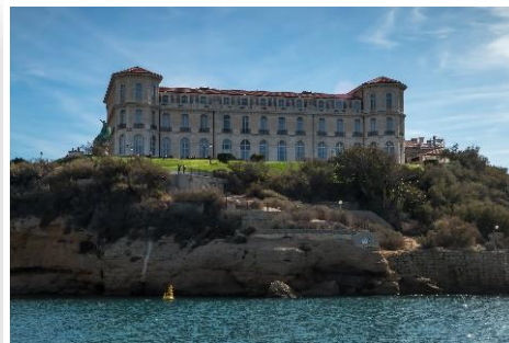
2020 PER-IADR Congress venue 'Palais du Pharo' at the old harbour of Marseille, France.

Together with the Scientific Committee members, we will program two-and-half day parallel sessions with oral and poster presentations, keynote and symposium lectures.