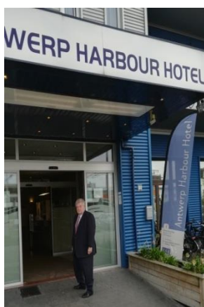
...and entering the new ones.

The moving manoeuvres had started Monday, October 12, when three moving vans with specialized equipment parked in front of 72/74. They were manned by a dozen of movers who, apparently inspired by the Antwerp port system: "fini/fini"