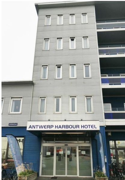
The new entrance of Stella Maris

( see 2. Antwerp Seafarers' Welfare). Out of our new base, we will continue to operate as before. The Antwerp Harbour Hotel is from now on our official registered office address.