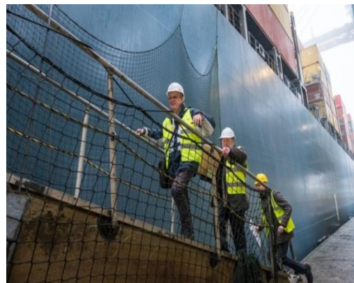
Distribution of gift packages on the gangway

The distribution of woolen hats and scarves during the year knitted by volunteers in the UK and Belgium is a welcome gift, especially with winter just around the corner. The chaplains and volunteer ship visitors have a supply of clothes, sweaters, anoraks, shirt and trousers distributed to the sailors. Many crewmembers come from warm, southern countries and are not always prepared for winter temperatures in the north.