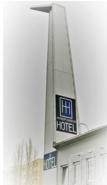
The Antwerp Harbour hotel is a landmark in the city and the port