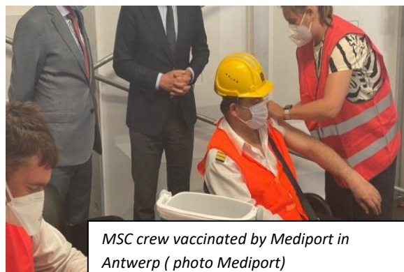
MSC crew vaccinated by Mediport in Antwerp

Belgium was thus the first country in the world to tackle the vaccination of seafarers in this way. In the port of Antwerp, GZA Hospitals (Antwerp hospital organisation), together with maritime doctors and nurses from MediPort (Maritime Medical Service), provided the crew vaccinations with the Johnson & Johnson vaccine.