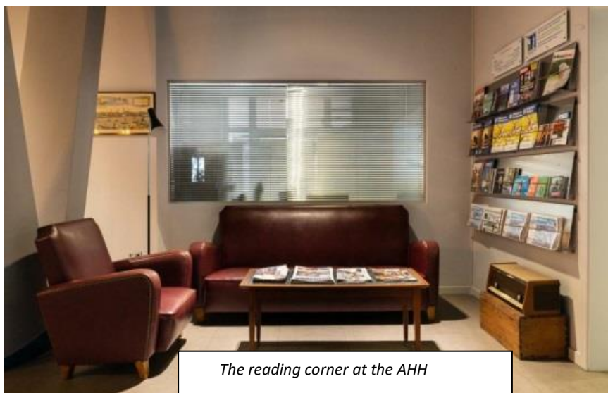
The reading corner at the AHH

With a financial support from Stella Maris, the Antwerp Harbour Hotel (AHH) refurbished