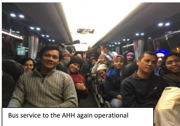
Bus service to the AHH again operational

T he situation in Belgium with the COVID-19 pandemic improved to such an extent that