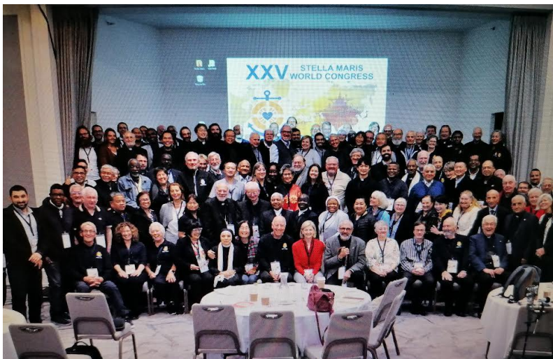
Participants to the World Congress

A global conference is a unique occasion to bring together port chaplains, ship visitors and volunteers from all over the globe. It is the place to exchange best practices and pass on information on how to deal with changing welfare issues of seafarers. In several workshops and panel presentations also representatives from the maritime industry gave their