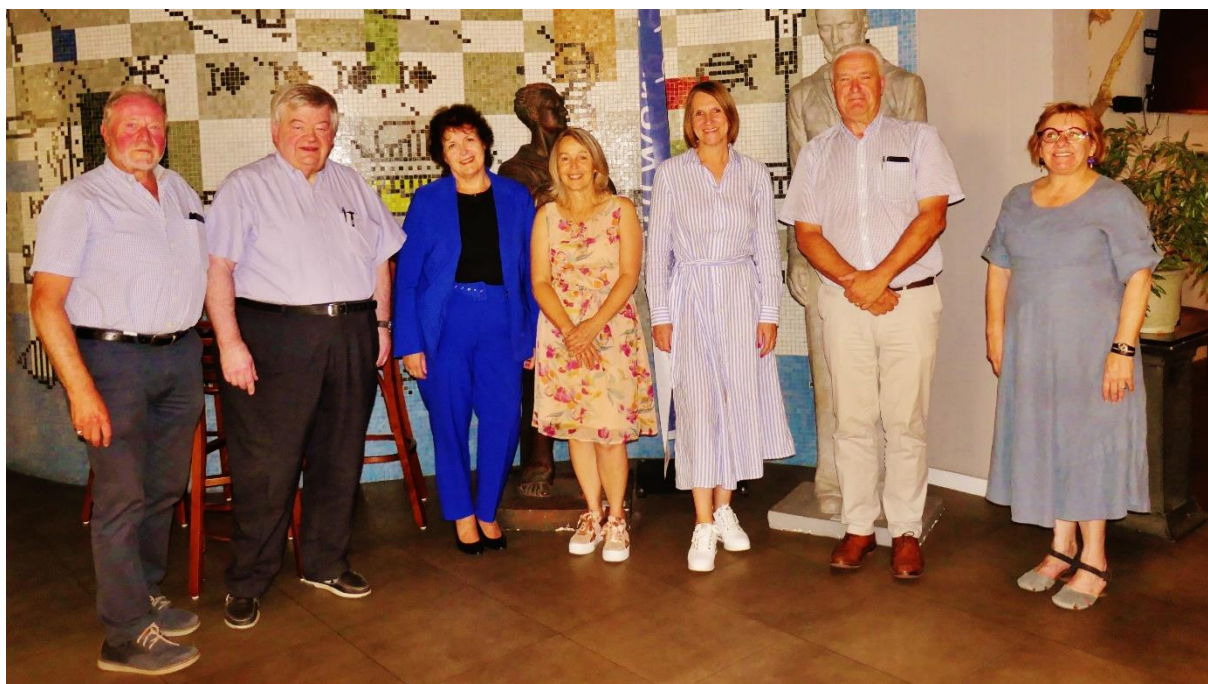
Management and Staff of both the Antwerp Shipping federation and Stella Maris

The participants showed a genuine interest in the different welfare organisations located at our new premises as well as the services offered by the Antwerp Harbour Hotel to seafarers.