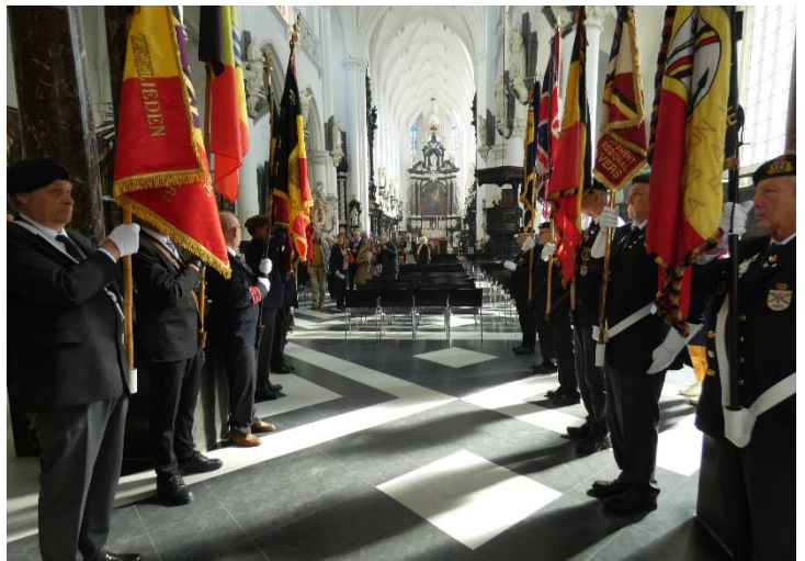
Honorary Guard at Sint-Paulus church

and J. Hayden. As closing song we were offered “Jubilate tota civitas” by C. Monteverdi, followed by the LAST POST (on clarion) and the National Hymn (on organ)