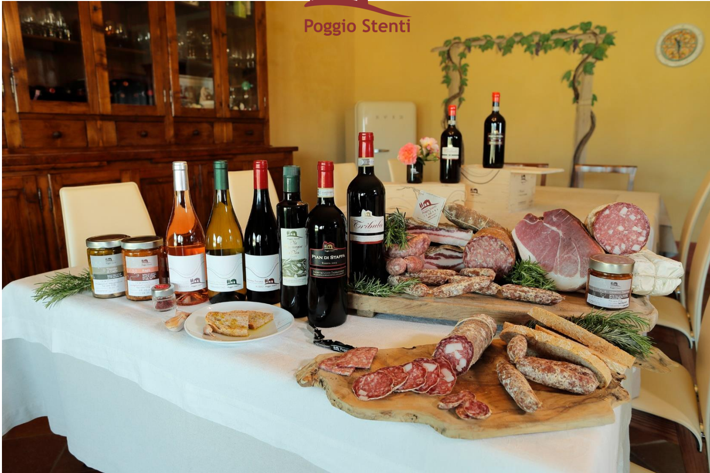
Poggio Stenti products