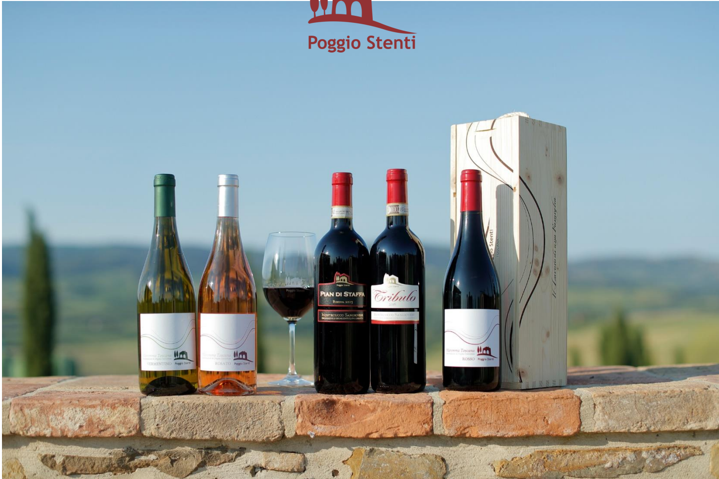
Poggio Stenti wines