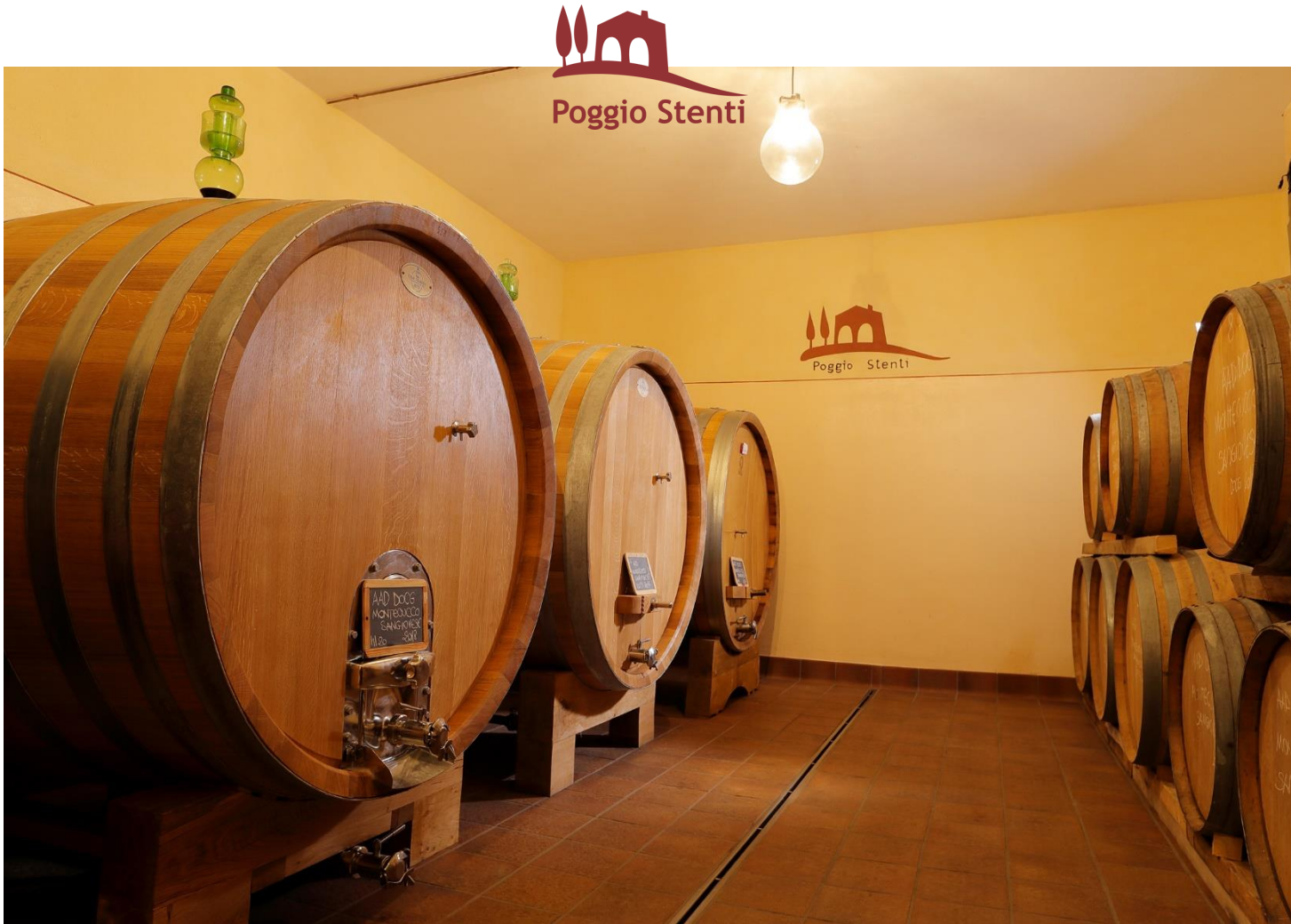
Poggio Stenti wine cellar