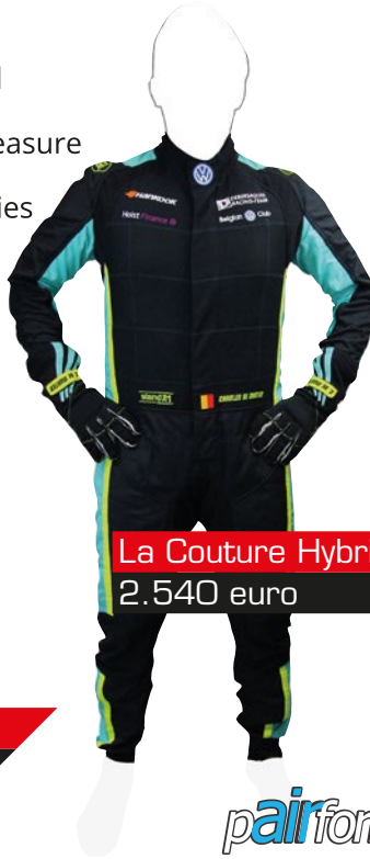
La Couture Hybride 2.540 euro