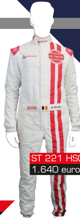
ST 221 HSC EVO 1.640 euro

These racing suits evolved as a direct result of heat stress research by medical professionals.