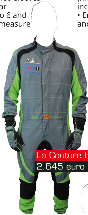
La Couture HSC 2.645 euro