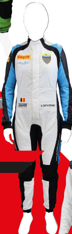
ST 221 Air-S 1.955 euro