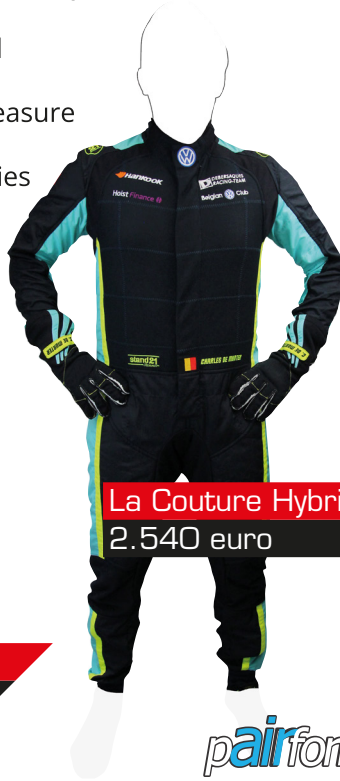
La Couture Hybride 2.540 euro