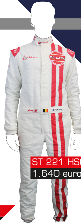
ST 221 HSC EVO 1.640 euro

These racing suits evolved as a direct result of heat stress research by medical professionals.