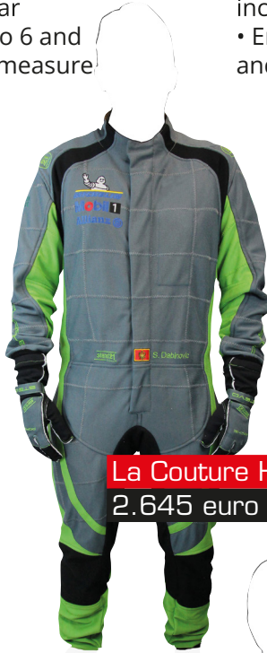
La Couture HSC 2.645 euro