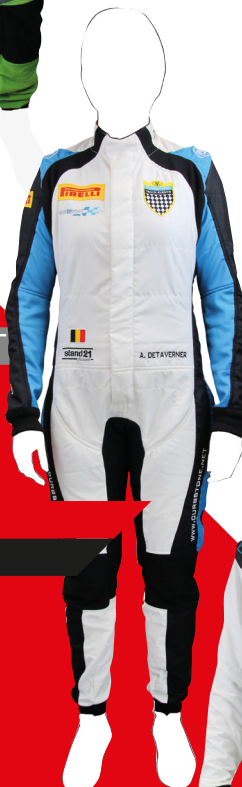
ST 221 Air-S 1.955 euro