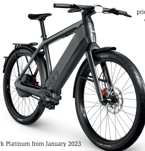
Dark Platinum from January 2023

For additional views, prices and options