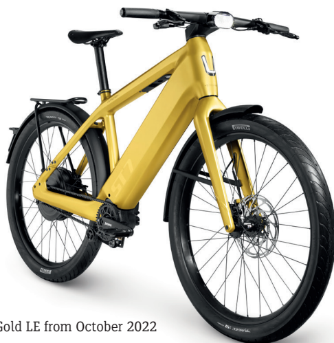
Solid Gold LE from October 2022