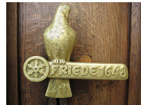
Town hall door handle