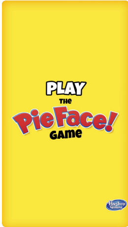
Top Snap Frame 0:03