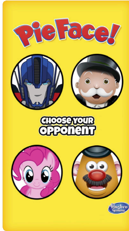
Top Snap Frame 0:05