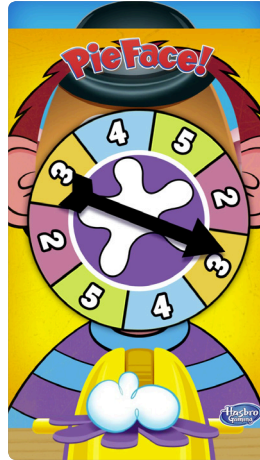
Web View Frame 1