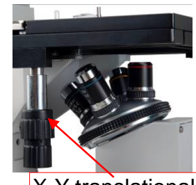
X-Y translational control knobs