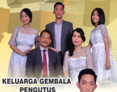
KELUARGA GEMBALA PENGUTUS

PENGUTUSAN MISIONARIS KE JEPANG TAHUN 2025