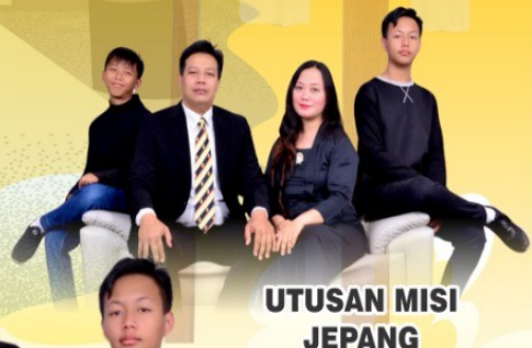
UTUSAN MISI JEPANG