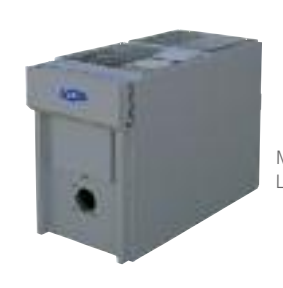
Model OVL Low-Boy

The Models OVM and CVM multi-poise are designed for versatility. With the ability to install in upflow, downflow and horizontal right and left applications, this proven performer is an excellent fit for virtually any home.