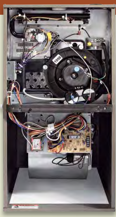
95.5% AFUE model shown

Electronic hot surface ignition saves fuel costs with increased dependability and reliability