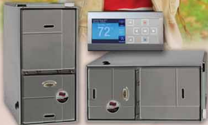
Model RGGE Downflow Model

Your life stays in motion. Yet you stay in total control. Cool and calm at the center of any storm, completely at home in your environment.