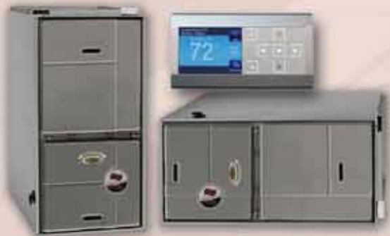
Model RGGE Downflow Model

Ruud Ultra Series® equipped with Comfort Control® System & Contour Comfort Control®