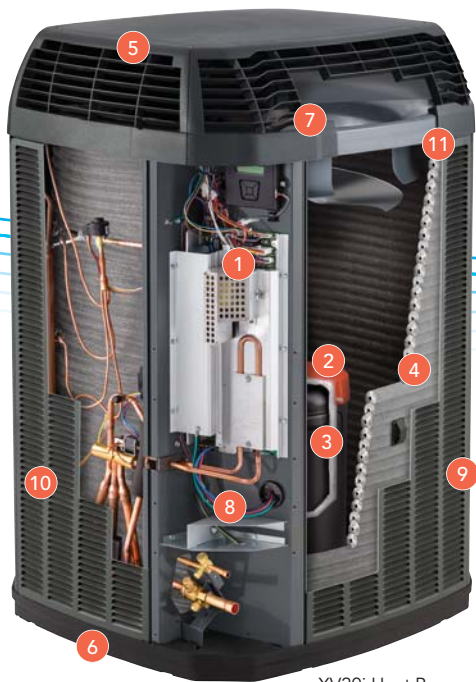
XV20i Heat Pump