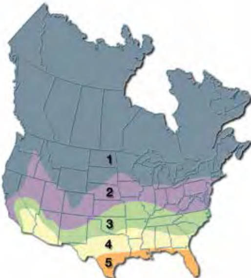
Approximate Annual Cooling Operating Costs