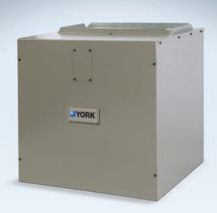
AFFINITY™ SERIES MV MODEL VARIABLE-SPEED, MODULAR DESIGN

Affinity<sup>™</sup> Series Air Handlers