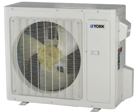
208/230V 9K-18K BTU/H INVERTER-DRIVEN HEAT PUMP SYSTEMS