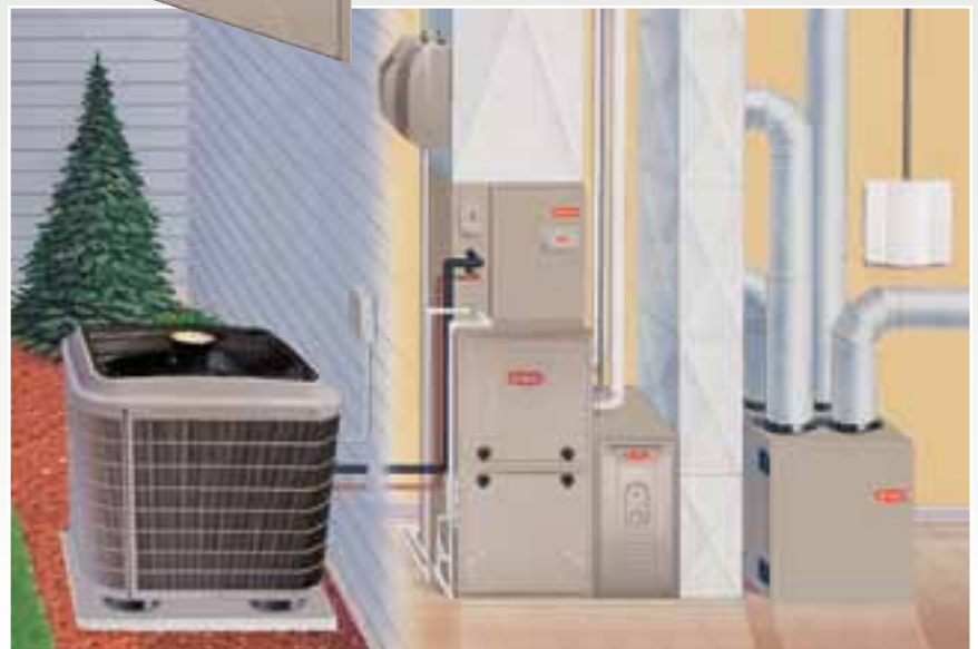
HYBRID HEAT® Deluxe Heat Pump and Deluxe Gas Furnace System